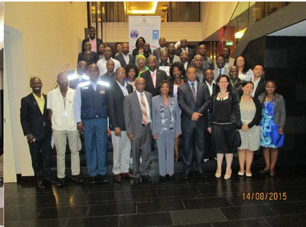
Group photo together with the State Secretary of the Ministry of Interior and the Governor a.i. of the Luanda province at the closure of the National Seminar.