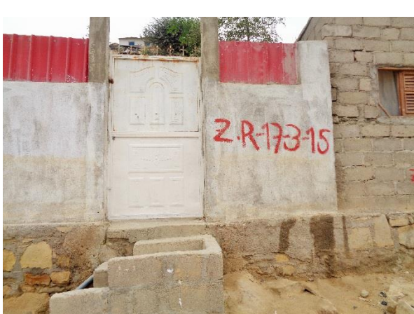
A house marked as built on risk zone in Lobito