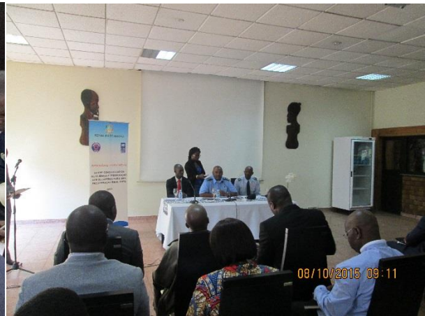
Opening ceremony of the Provincial Seminar in Huila on 8-9 October 2015