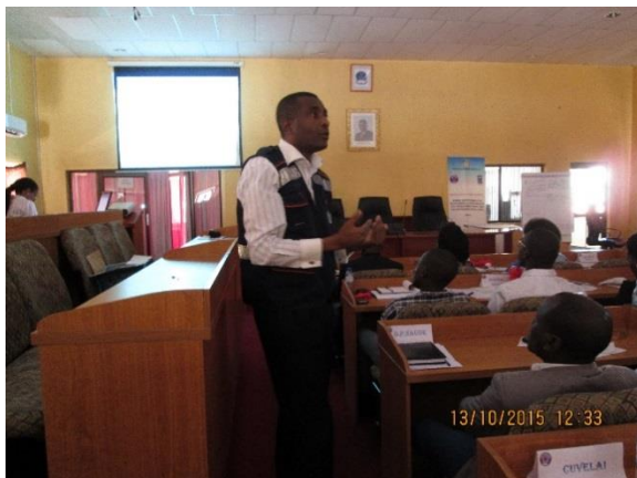
A lecture by SPCB trainer during the Provincial Seminar in Cunene on 12-13 October 2015