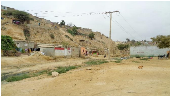
The houses affected by the flood in Lobito