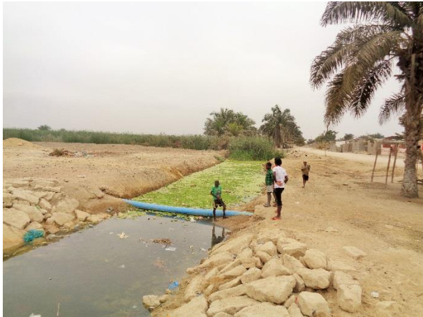
A drainage that had overflowed due to the piled up garbage in Catumbela