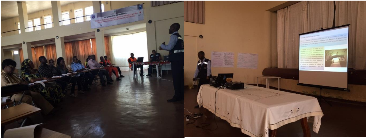
A lecture by SPCB trainer during the Municipal Seminar at Matala, Huila on 29-30 October 2015