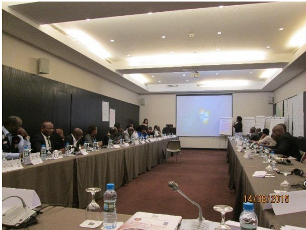
A presentation from the group work during the National Seminar on 11-14 August 2015

All 29 national practitioners who completed self-evaluation forms stated that they were now familiar with the subjects. But almost all requested additional training, highlighting needs for continued support in training. In addition to the continued capacity building both at the national and local levels, the participants also highlighted importance of integrating DRR and resilience building into the national / local development plans / processes to realize the risk-informed development and resilient communities both before and after a disaster.