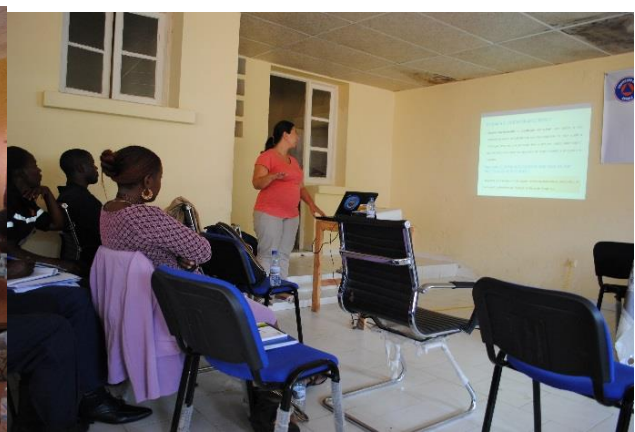
A lecture by UNDP Resilient Recovery expert during the Municipal Seminar in Bibala, Namibe on 19-20 October 2015