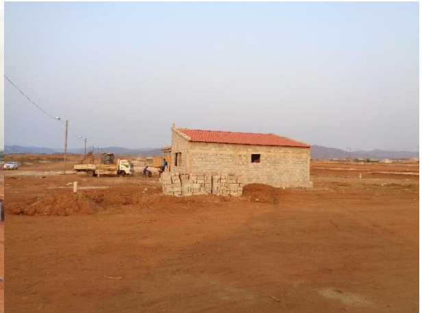
Housing construction at the Cabrais settlement