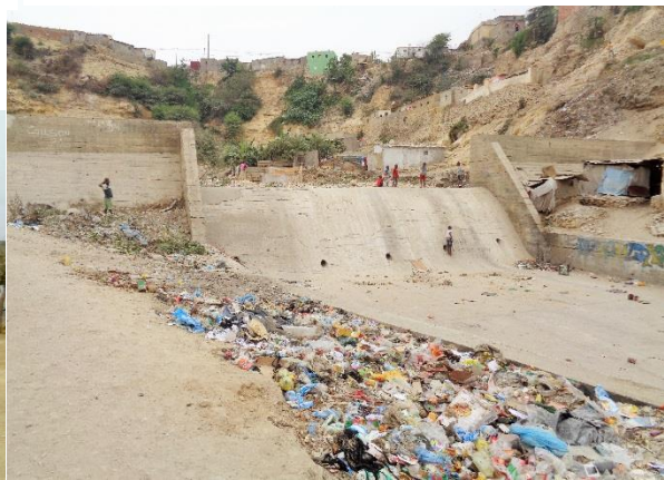
The area affected by the flood in Lobito