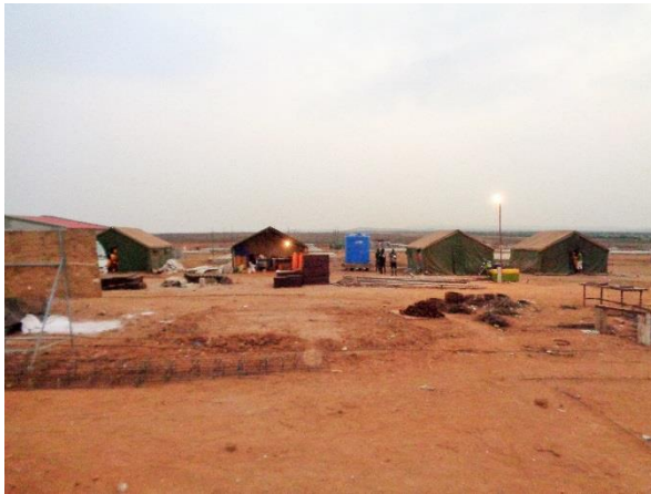
New settlers starting to build houses at the Cabrais settlement