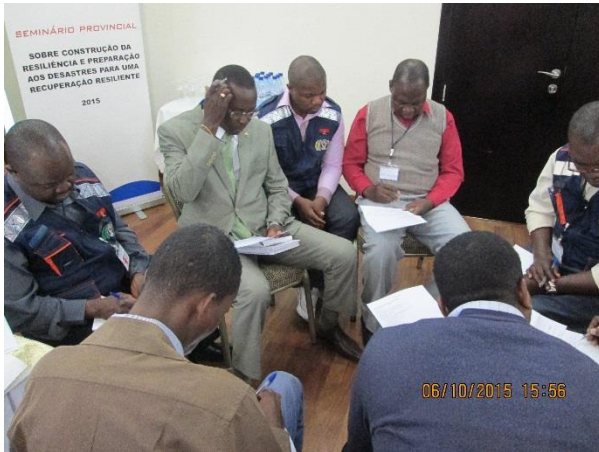
A group work during the Provincial Seminar in Namibe on 5-6 October 2015

concepts and tools for pre- and post-disaster recovery planning, as well as resilience-building. As part of the local training seminars, the Civil Protection focal points for the implementation of resilience-building strategies were provided with on-the-job training on their roles as focal points (8 in four provinces and 12 in six municipalities). The municipalities covered by this training in 2015 are Bibala and Camucuio in Namibe, Chibia and Matala in Huila, and Cahama and Namacunde in Cunene. The local seminars prepared ground for the subsequent preparation of pilot Pre-disaster Resilient Recovery Plans scheduled in 2016.