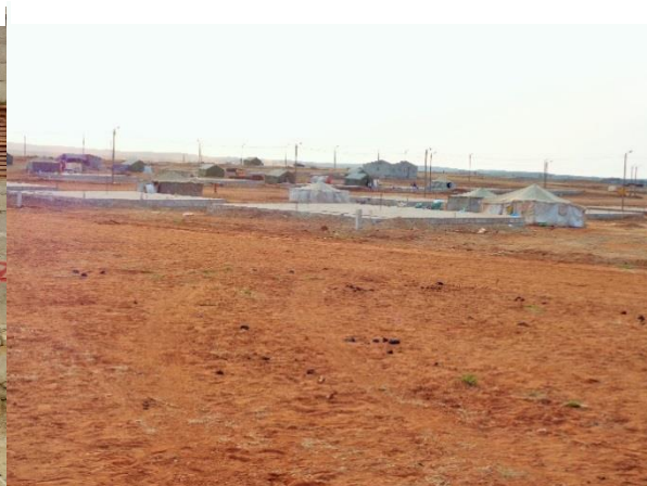
The foundations for the future homes at the Cabrais new settlement